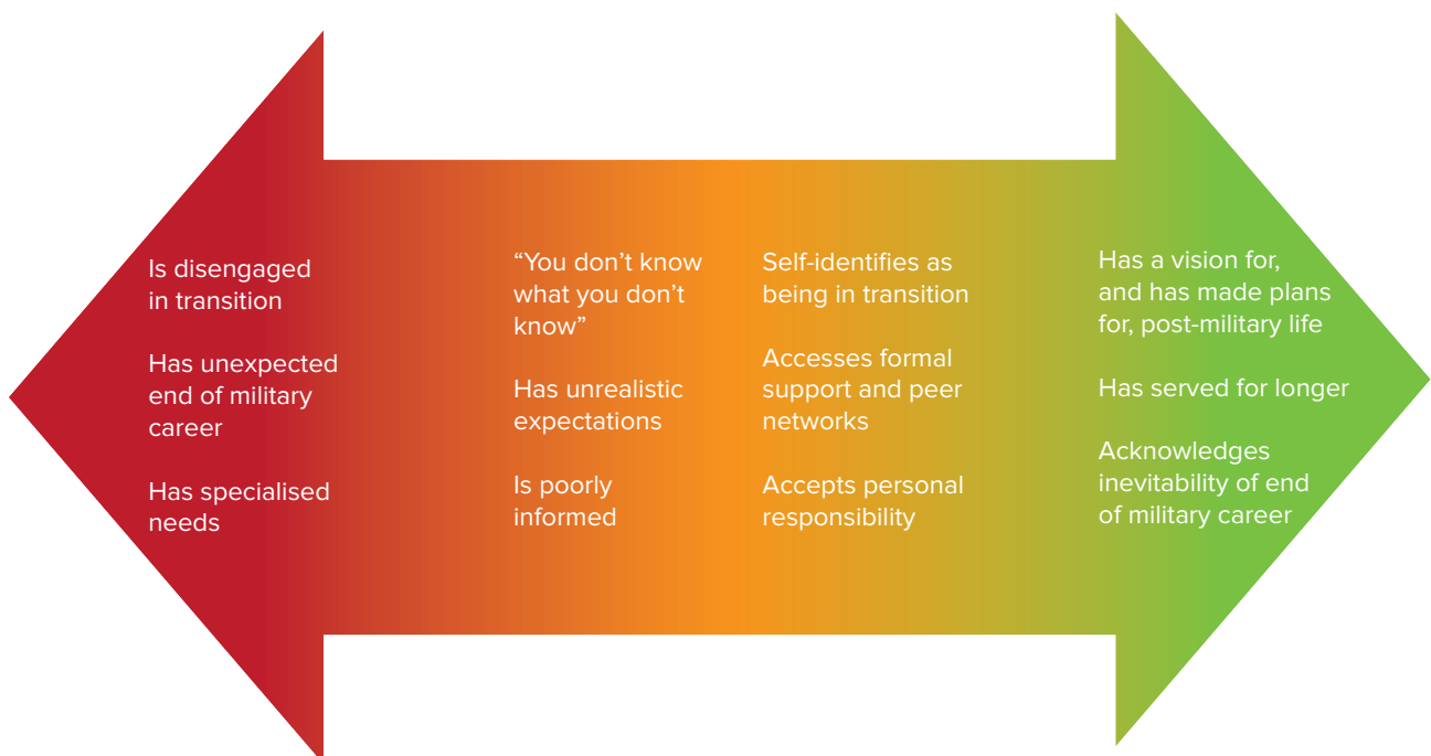
Figure A: the characteristics of families in transition

Families at the left end of the continuum include those whose SL is medically or administratively discharged. In such cases, a family may have less time to prepare due to the unexpected nature of the SL’s discharge and/or they may be coming to terms with discharge being sooner than they anticipated. Such families can experience a heightened level of uncertainty or distress, which may not be conducive to forward planning. The challenges they encounter may be compounded by the needs associated with physical or mental ill-health. F&C families with